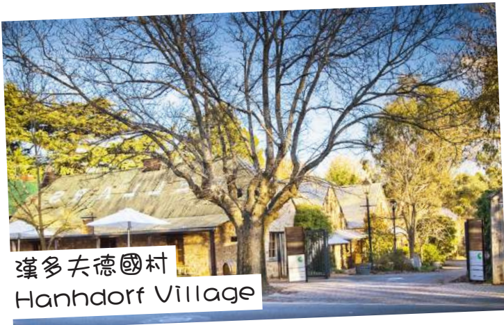
漢多夫德國村 Hanhdorf Village