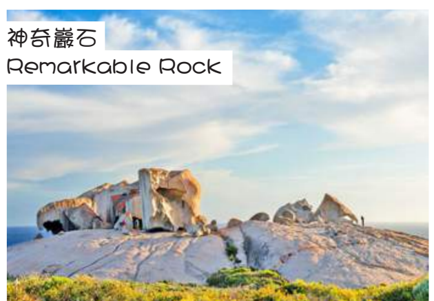
神奇巖石 Remarkable Rock