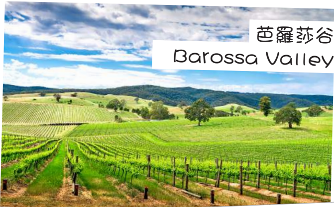
芭羅莎谷 Barossa Valley